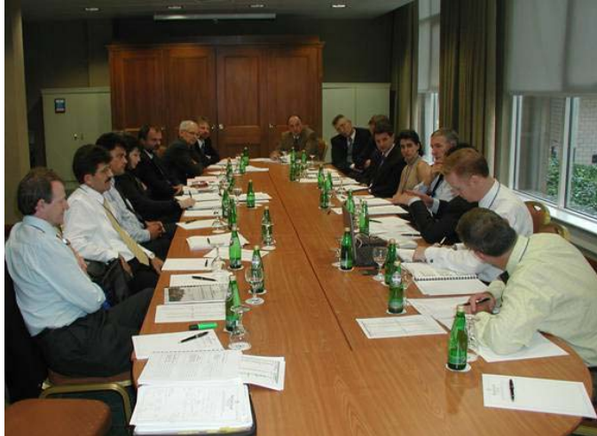
Workshop participants at the plenary in the Edinburgh Sheraton Hotel