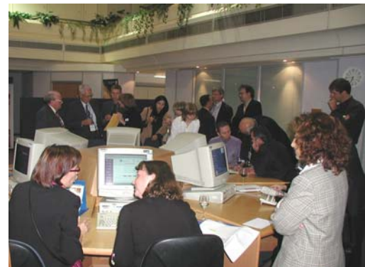
Technical visit at the Registers of Scotland' Customer Service Centre in the downtown of Edinburgh