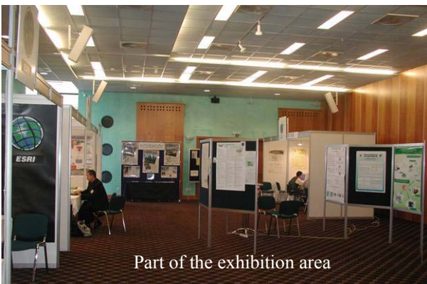
Part of the exhibition area