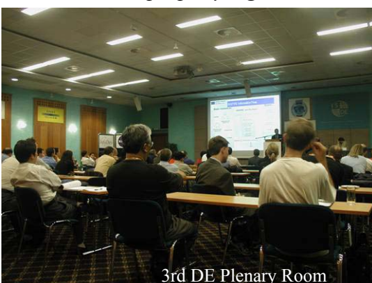
3rd DE Plenary Room

region), the lecturer was approached by the Bulgarian Delegation, who are dealing with a similar type initiative but in the subject Spatial Data Infrastructure anticipated the South East European (SEE) countries as beneficiaries. The Hungarian lecturer was invited to Sofia between 23-24 October, 2003 for the international Conference and Exhibition on SDI in the SEE, where the experiences on CelkCenter and