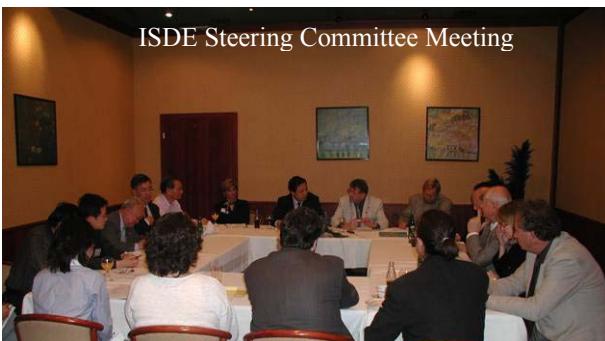
ISDE Steering Committee Meeting

Keio University was chosen taking into account also the geographical balance, which was welcomed by the Hungarian bid representative.