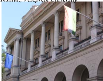
The Ministry of Agriculture and Rural Dev. hosts the Secretariat since 1994.