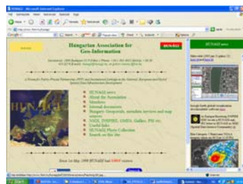
Homepage of HUNAGI

So far 33055 visitors (as of 23.09.2005)